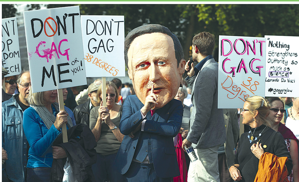
Free speech campaigners hold placards while one wears a mask depicting British Prime Minister David Cameron as they participate in a protest opposite the Houses of Parliament in central London.