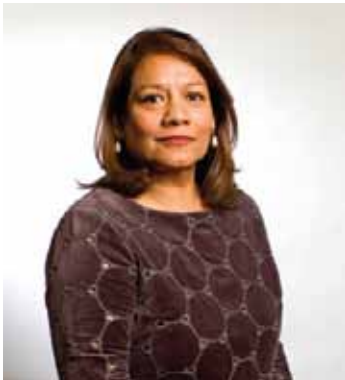
Valerie Vaz MP A Member of Parliament for Walsall South