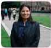
Priti Patel MP, Member of Parliament for Witham