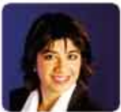
Seema Malhotra MP Member of Parliament for Feltham and Heston