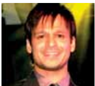
Vivek Oberoi Bollywood Actor Philanthropy Me and We - July 2014