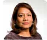
Valerie Vaz MP Elected as the Member of Parliament for Walsall South Creating and Seizing Opportunities! 9th October 2014