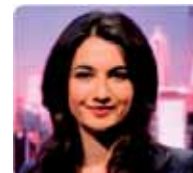
Yalda Hakim Presenter, Impact - BBC World News and Journalist The World in Which WE Live January 2015