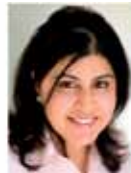
Baroess Sayeeda Warsi British Pakistani Lawyer, Politician and Conservative Parliamentarian The World in Which WE Live January 2015