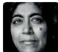
Gurinder Chadha OBE Film Director Think Big - February 2014