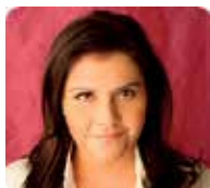
Nina Wadia British Actress Make an Impression Event - May 2013