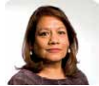
Valerie Vaz MP Elected as the Member of Parliament for Walsall South Creating and Seizing Opportunities! 9th October 2014