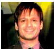
Vivek Oberoi Bollywood Actor Philanthropy Me and We - July 2014