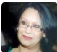
Rt Hon Baroness Verma Government Spokesperson for Higher Education (BIS) Women and Equalities and Whip

for the Cabinet Office. Launch Event - May 2012