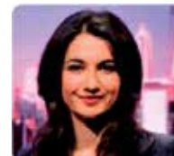
Yalda Hakim Presenter, Impact – BBC World News and Journalist The World in Which WE Live January 2015