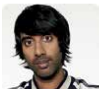
Nihal Arthanayake DJ, Radio & TV Presenter Make an Impression Event - May 2013