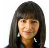
Ranvir Singh is the multi-award-winning presenter of Good Morning Britain - March 2015