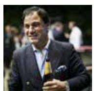
Karan Bilimoria is the founder of Cobra Beer - June 2016