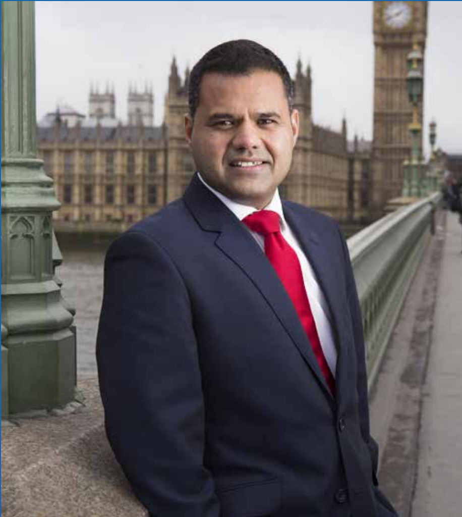
Rajesh Agrawal Deputy Mayor of London for

Rajesh Agrawal is the Deputy Mayor of London for Business. Born in India, Rajesh moved to London in 2001.