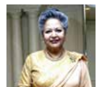
The Baroness Flather was born in Lahore & educated at UCL - June 2016