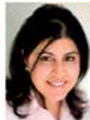
Baroess Sayeeda Warsi British Pakistani Lawyer, Politician and Conservative Parliamentarian The World in Which WE Live January 2015