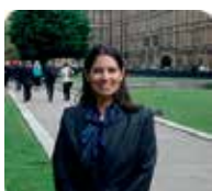
Priti Patel MP Member of Parliament for Witham Is it a Man's World Event - January 2013